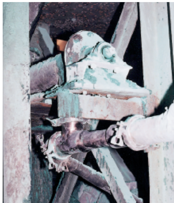
Close-up of the eductor

The second photo shows a close-up of the Fox eductor after ten years of pneumatically handling and conveying copper sulfate from a screw conveyor.